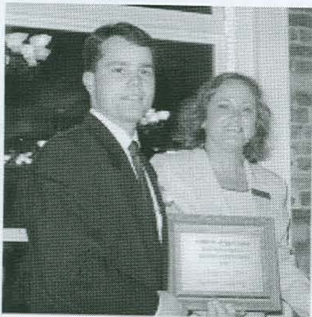
COGNITION AWARDS OUTSTANDING CHAMBER SUPPORTER PRESBYTERIAN HOME CHAMBER SUPPORTER, BURTON REALTY AND AUCTION)