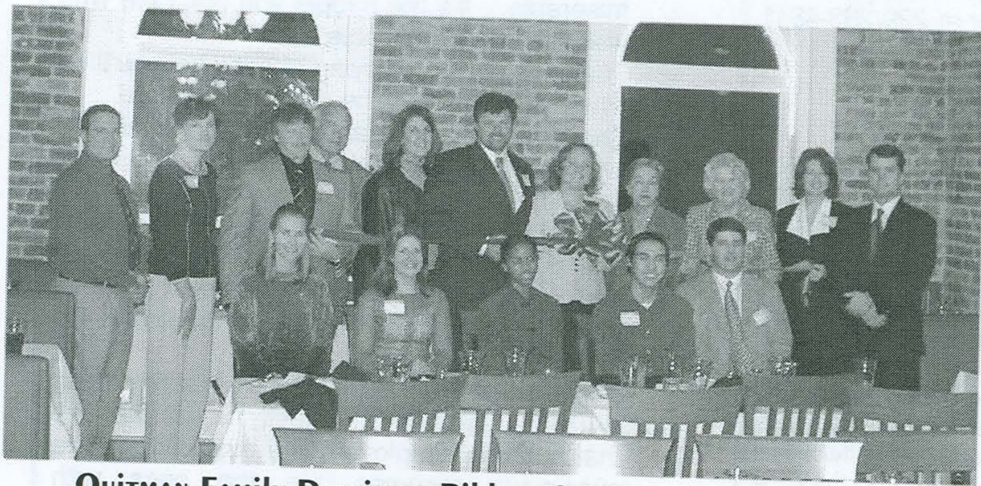
QUITMAN FAMILY DENTISTRY RIBBON CUTTING