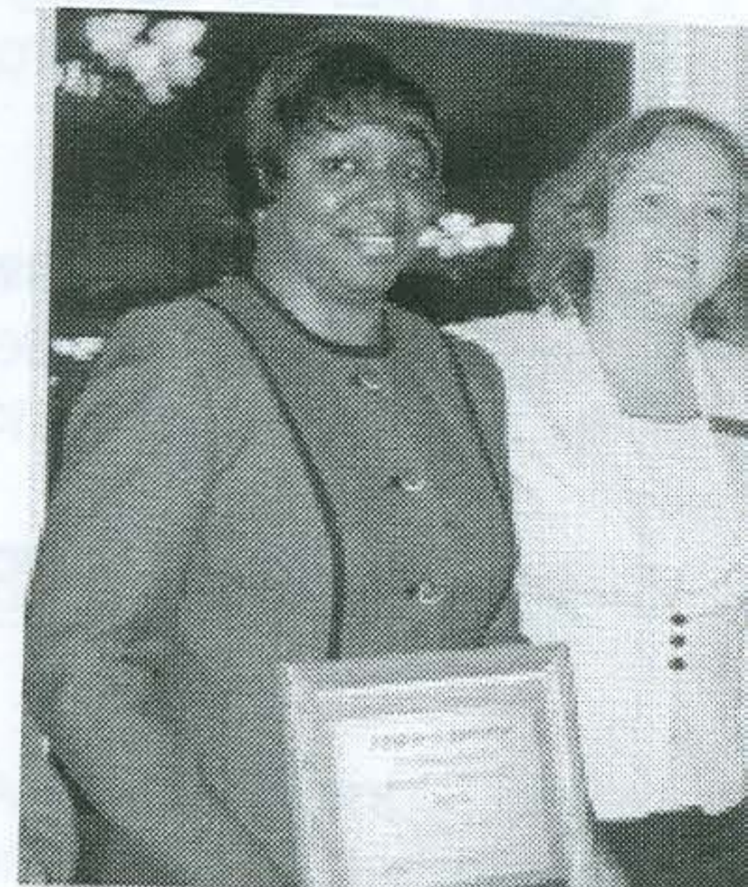
SPECIAL R OUTSTANDING INTERNSHIP VANESSA JONES (NOT PICTURED, OUTSTANDING CHA