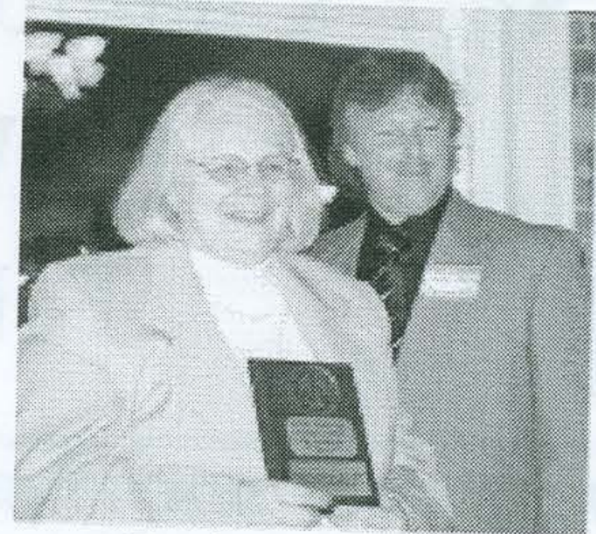
LARGE BUSINESS OF THE YEAR MICRO CRAFT