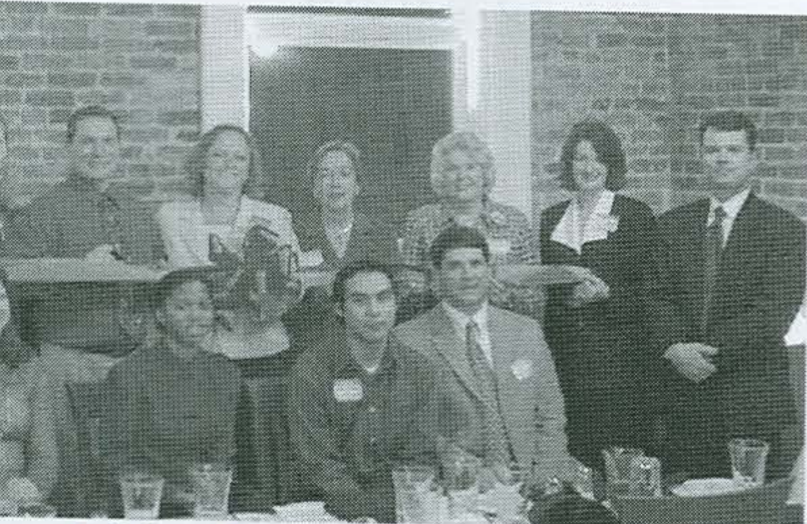
WOMEN'S RIBBON CUTTING