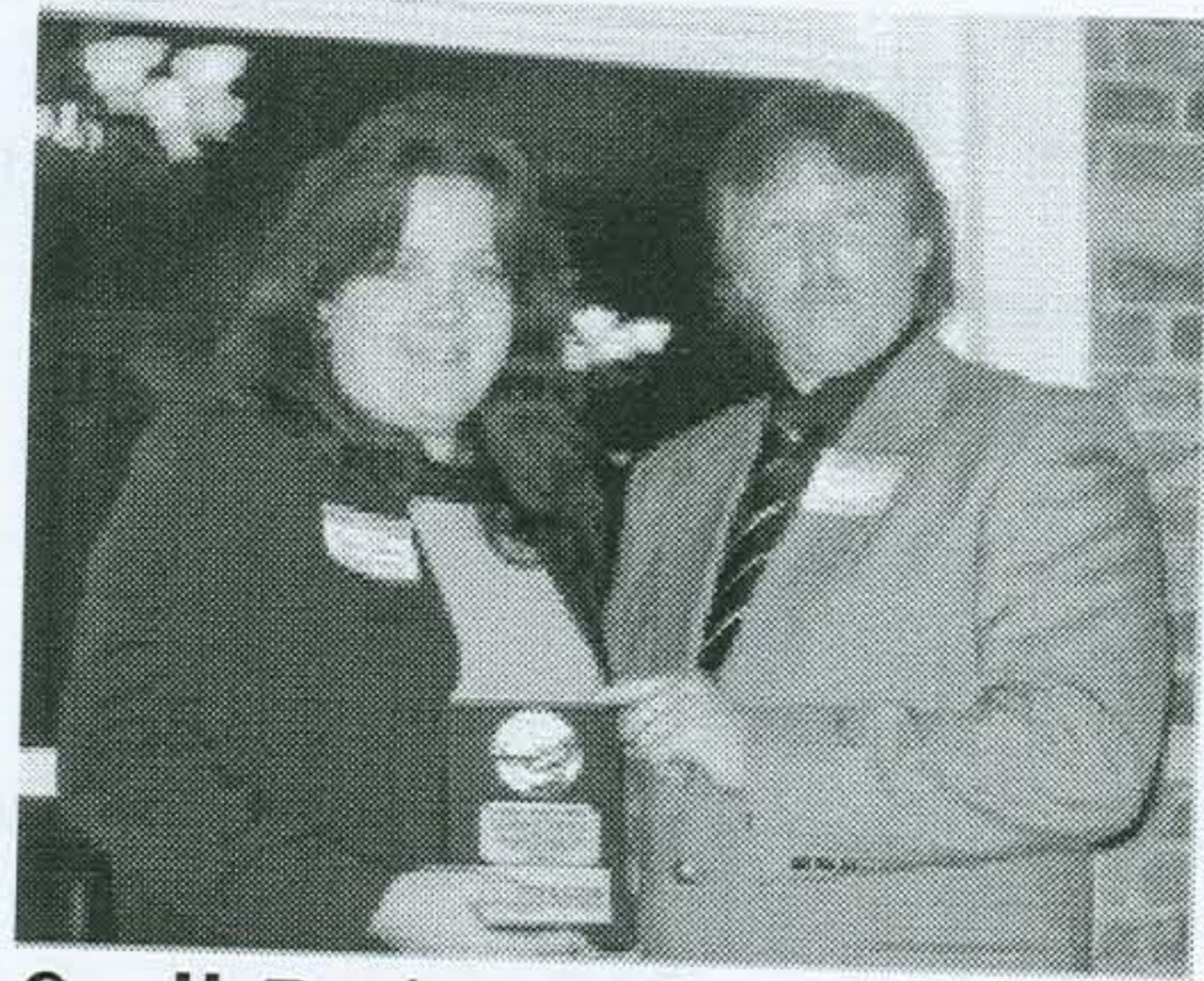
SMALL BUSINESS OF THE YEAR TWISTED SISTERS!